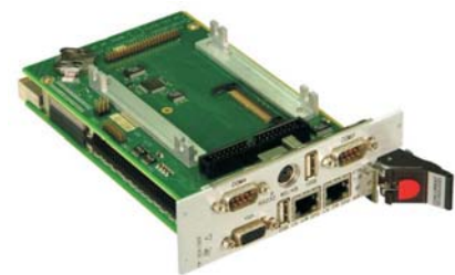
Dual Slot Option