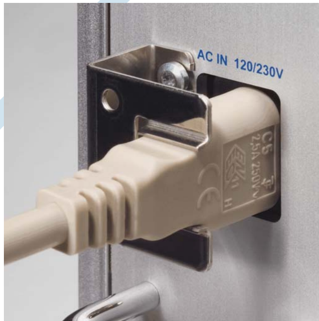
AC Power Cord Fastener