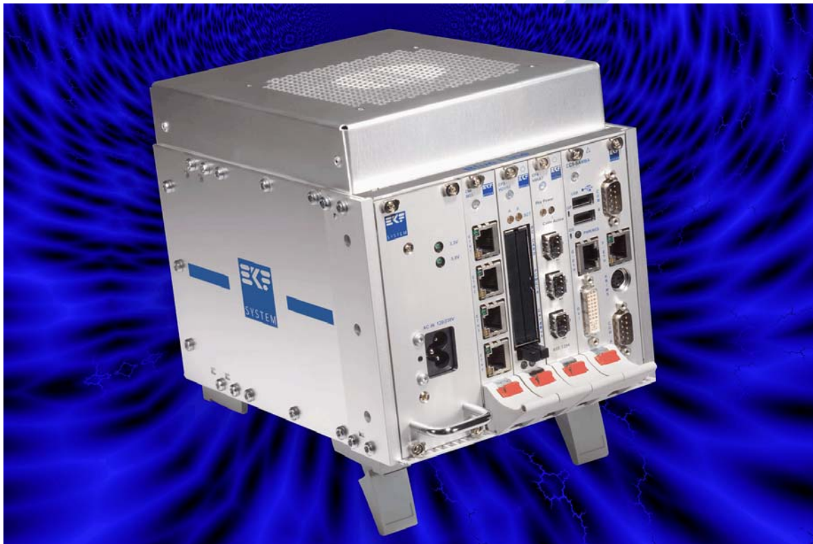
CRB-BLUELINE with Fan Unit for High Performance CPU Usage

The overall reliability of any system depends in particular on the quality of its power supply unit. BLUE LINE systems are provided with a removable, high-grade industrial PSU from a leading German manufacturer. As of current, the CRB-BLUELINE systems can be equipped with PSU versions suitable either for 120/230VAC, 24VDC or 12VDC power line input (automotive applications). The BLUE LINE is a long-time available and scalable IPC system, combining high reliability and small size with an affordable price, thus forming the better alternative compared to many other PC based solutions. Please request for custom specific versions, tailored to your individual needs. Quality pays, its up to you!