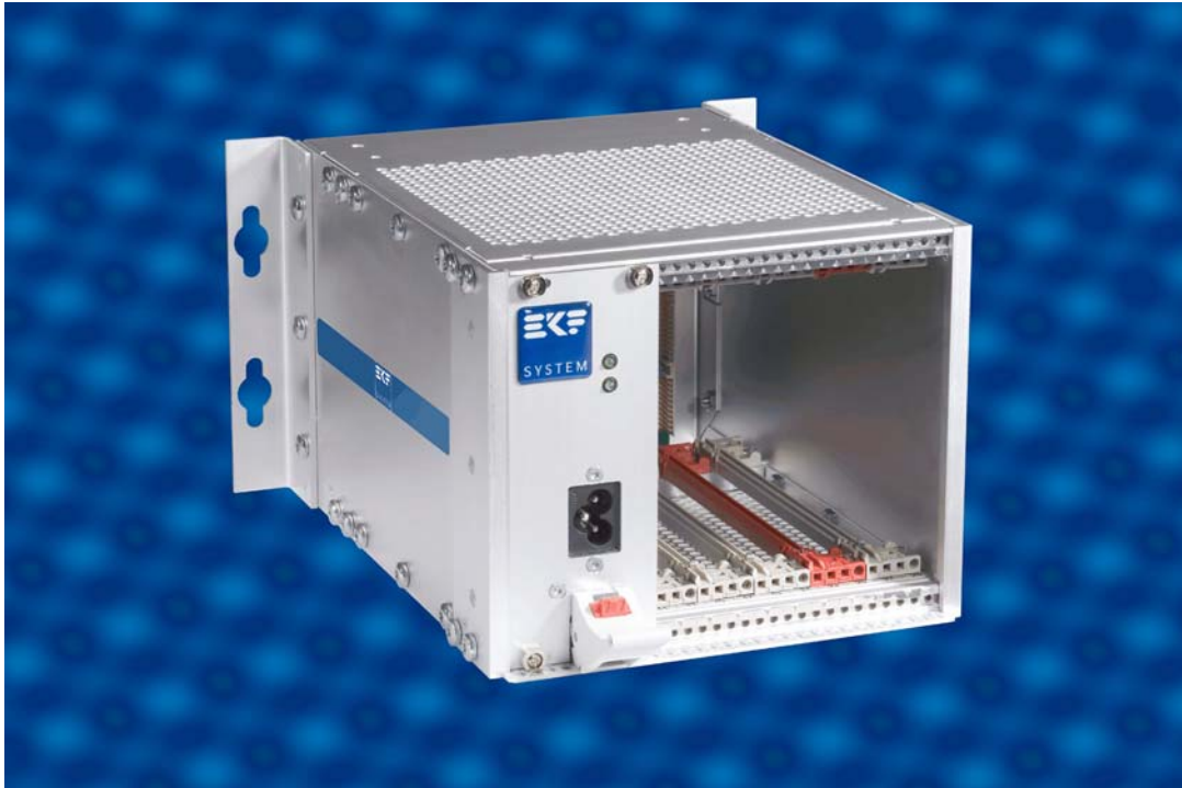
CRB-BLUELINE with Wall Mount Brackets