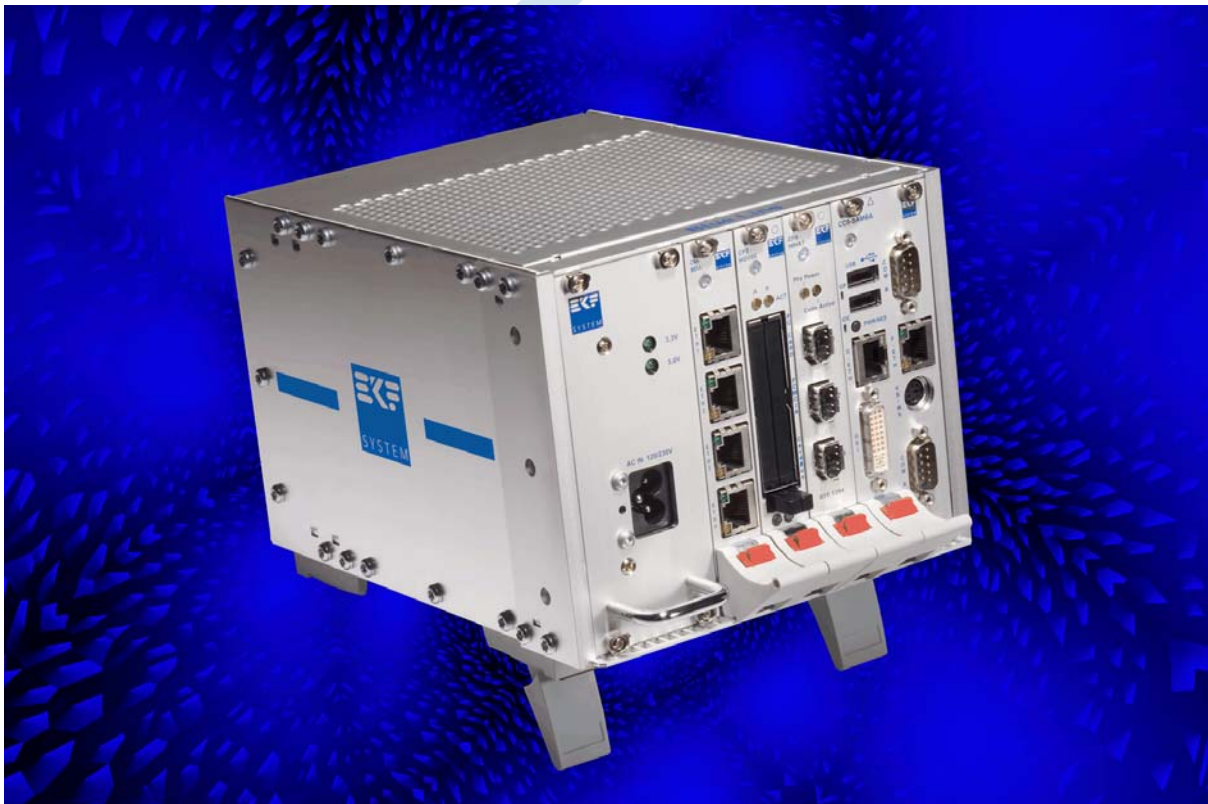
CRB-BLUELINE Small Expandable Systems

A mass storage device, either 2.5- or 1.8-inch hard disk, or a CompactFlash card (Microdrive), is integral part of the CPU module. Cooling by natural convection is already sufficient for low power processor boards.