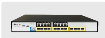
Mediant™ 800 E-SBC

Based on these ten points, it should be clear that AudioCodes should be your #1 choice for SIP Trunking interoperability, security and quality. For more information on AudioCodes' SIP Trunking products, visit: http://www.audiocodes.com/sip-trunking .