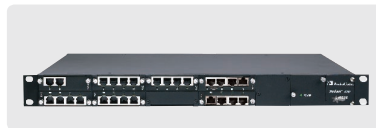
Mediant™ 1000 E-SBC