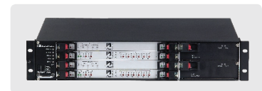
Mediant™ 3000 E-SBC