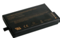
Main Battery / Low Temperature Battery (7800mAh) Lightweight Battery (5200mAh)