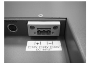
Phoenix-type power input