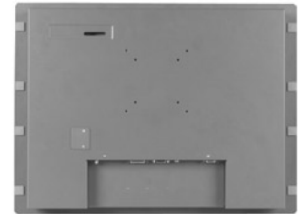
Various mounting ways Panel/ Wall/ VESA