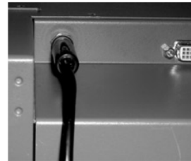
Screw-type power input