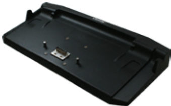
Office Dock W x D x H: 352.7 x 117.5 x 50.2mm (13.88" x 4.62" x 2.04")