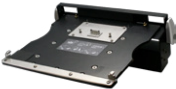
Vehicle Dock W x D x H: 374.6 x 310 x 150mm (14.74" x 12.2" x 5.9")