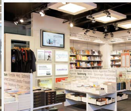
Book shop Hollmann, Duesseldorf / Germany