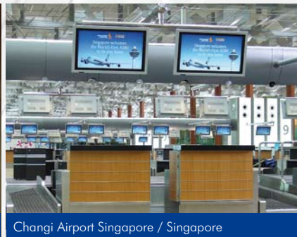
Changi Airport Singapore / Singapore