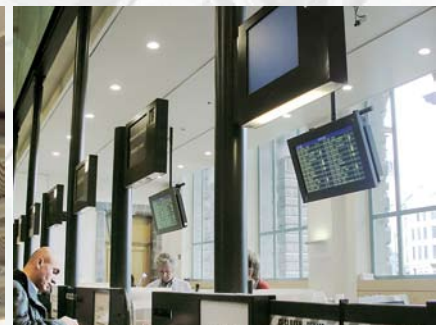
Antwerp Train Station / Belgium