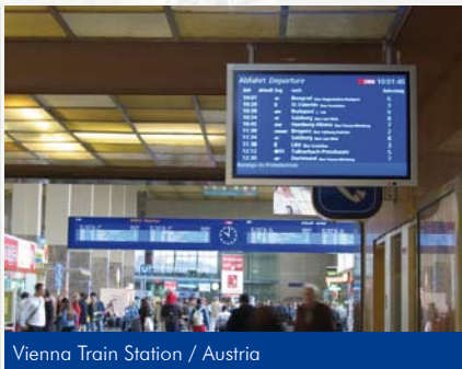
Vienna Train Station / Austria

The intelligent cooling system works in two cycles, an open loop and a closed loop. Despite the Public Displays' safety glass panel, it cools the TFT panel from front and back. Depending on the display size and its power consumption, one, two or more air ventilation ducts can be integrated. Furthermore, a special sealing method avoids dust accumulation inside the display. The cooling system is very energy efficient and maintenance-free, reducing the cost of ownership.