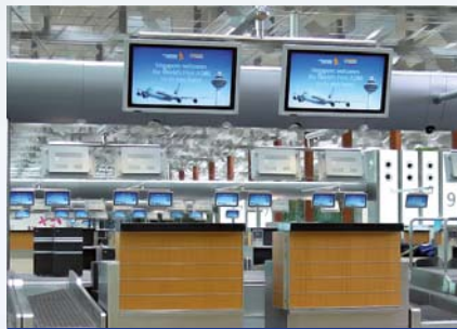
Changi Airport / Singapore