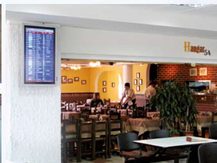
Bogota Airport / Colombia