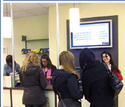
Book shop Huebscher, Kulmbach / Germany