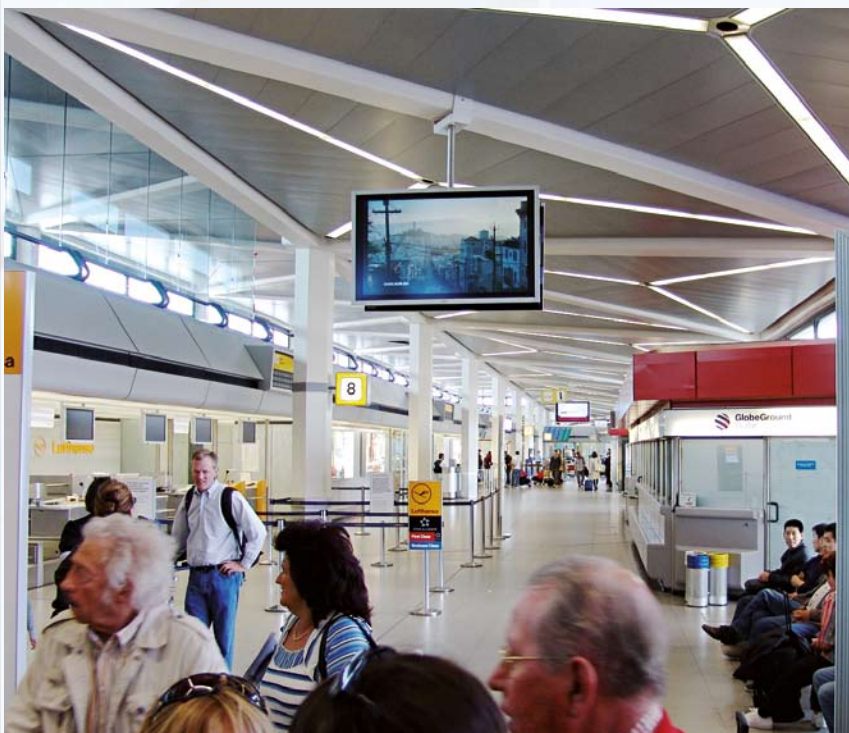
Tegel Airport Berlin / Germany