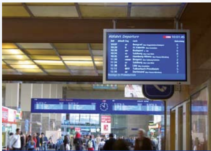
Vienna Train Station / Austria