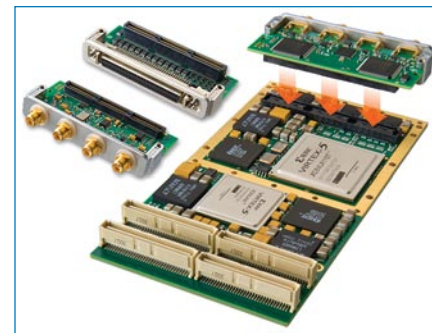
AXM extension I/O modules plug into a mezzanine connector on many Acromag FPGA boards to provide additional I/O signal processing capabilities.